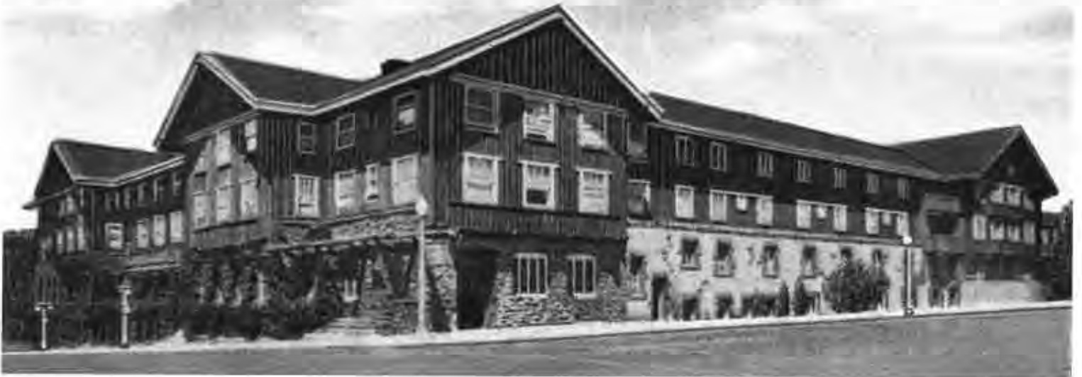
The Pilot Butte Inn, named "The Finest Little Hotel in America" by author Irving S. Cobb. Located on the corner of Wall Street and Newport Avenue, this colorized postcard shows the hotel at the height of its storied past.

Author Irving Cobb called it "The Finest Little Hotel in America." Former presidents, movie stars, skiing legends, local dignitaries, lumber buyers, and even a sitting First Lady walked through the doors of Pilot Butte Inn during its storied past.