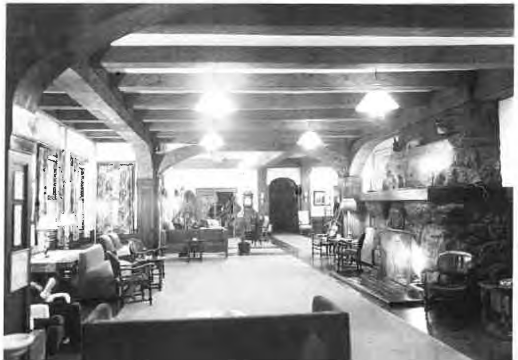
The reception area with the grand fireplace, which now can be found at the Athletic Club of Bend