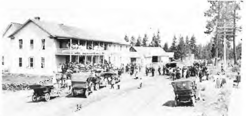
The two previous iterations of the Pilot Butte Inn. Left: Built three years before Bend attained city status in 1905, the first hotel was built by B. F. Zell. The second Pilot Butte Inn was built in 1905 and later expanded in 1909. Renamed the Colonial Inn in 1930.